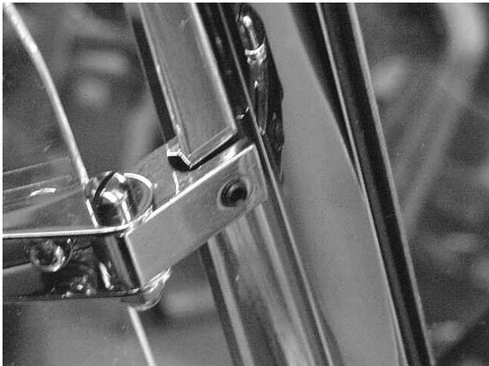
Wind Wing bracket mounted to the windshield sidebar.