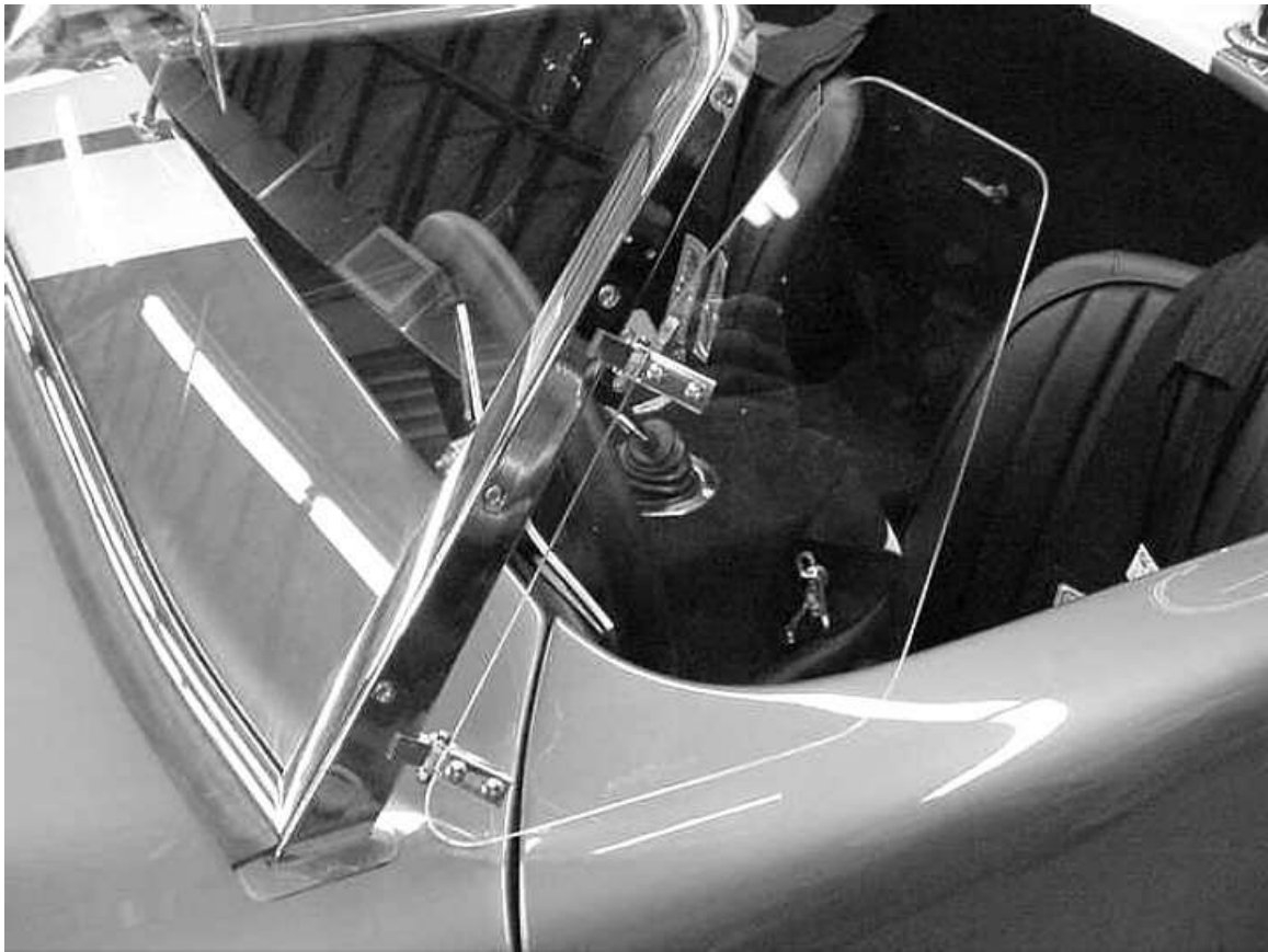
Wind Wing mounted to the windshield.